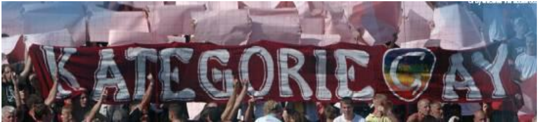
Homophobic taunts by Union Berlin fans against rivals Dynamo Dresden