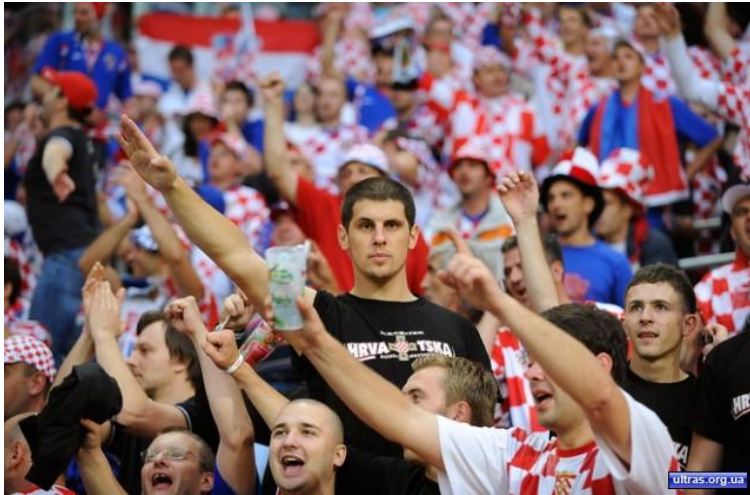
Croatian fans at UEFA EURO 2008